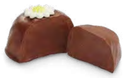
Chocolate Butter Egg Creamy and delicious. 3 oz $8.50 #506611