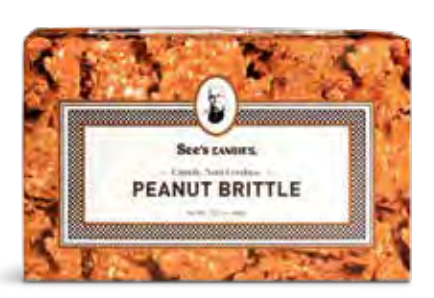
Peanut Brittle Buttery, crunchy and irresistible. 1 lb 8 oz $29.00 #500355 Amount towards Fundraising: $5.80