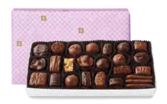
Assorted Chocolates Milk and dark decadence. Delivered in seasonal wrap. 1 lb $29.00 #540318 Amount towards Fundraising: $5.80