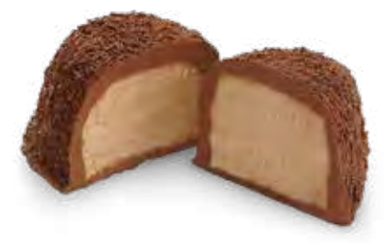
Bordeaux™ Egg A tasty classic. 3 oz $8.50 #509501 Amount towards Fundraising: $4.25