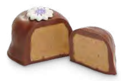
Peanut Butter Egg An irresistible treat. 3 oz $8.50 #506610 Amount towards Fundraising: $4.25