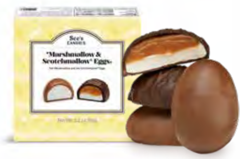
Marshmallow & Scotchmallow Eggs One box, four yummy eggs. 3.4 oz $9.00 #509493 Amount towards Fundraising: $4.50