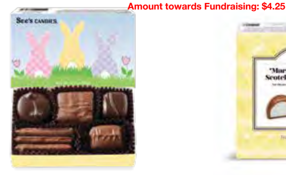
Hoppy Surprise Box Full of See's favorites. 3.5 oz $11.00 #508693 Amount towards Fundraising: $5.50