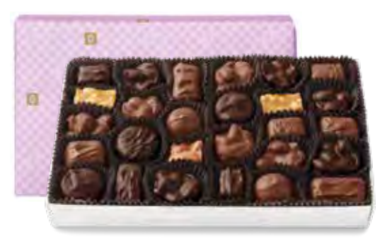
Nuts & Chews Yummy, crunchy and chewy. Delivered in seasonal wrap. 1 lb $29.00 #540334 Amount towards Fundraising: $5.80