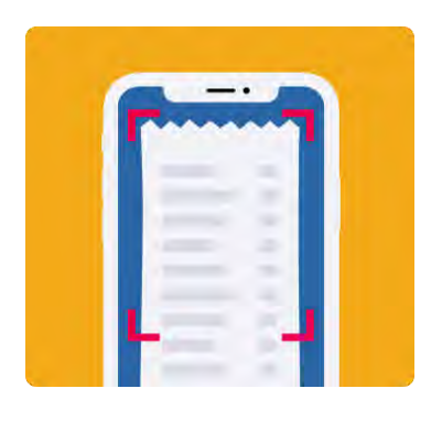
SCAN YOUR RECEIPT

Earn for schools with the brands you love.