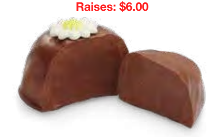
Chocolate Butter Egg

Creamy and delicious. 3 oz $8.50 #509500