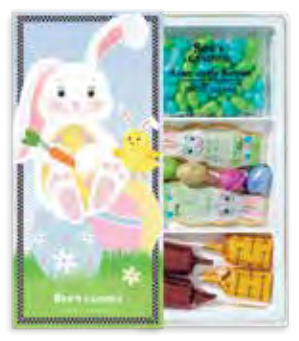
Easter Friends Box

An array of adorable bites. 7.5 oz $12.50 #508694