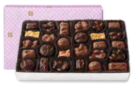
Nuts & Chews

Yummy, crunchy and chewy. Delivered in seasonal wrap. 1 lb $29.50 #540334