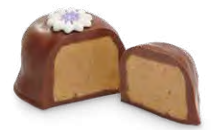
Peanut Butter Egg

Crunchy toffee, milk chocolate and almonds. 1 lb $29.50 #500316