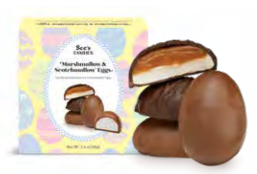
Marshmallow & Scotchmallow Eggs One box, four yummy eggs.