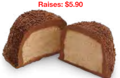
Bordeaux Egg A tasty classic.