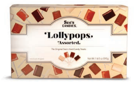
Assorted Lollypops Vanilla, Butterscotch, Café Latté and Chocolate. Approximately 30 lollypops. 1 lb 5 oz $18.50 #296 \\exists