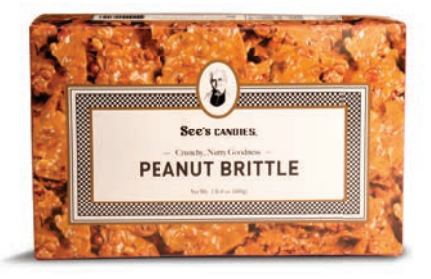
Peanut Brittle Buttery, crunchy and irresistible. 1 lb 8 oz $19.00 #355 BSB.