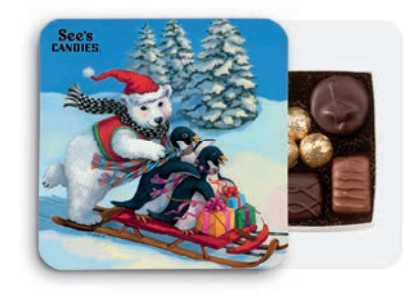
Polar Pals Box The ultimate stocking stuffer: 4 oz $7.00 #278