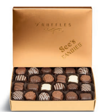
Truffles Wonderfully decadent and rich. 1 lb $21.80 #902