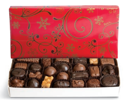
Assorted Chocolates Milk and dark decadence. Delivered in holiday wrap. 1 lb $19.30 #318 2 lb $38.60 #319