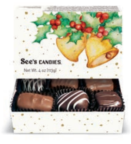
Mini Jingle Bells Assortment An irresistible treat. 4 oz $7.00 #6976