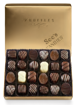
Truffles Wonderfully decadent and rich.

Pure milk chocolate goodness. Delivered in seasonal wrap. 1 lb $25.50 #50326