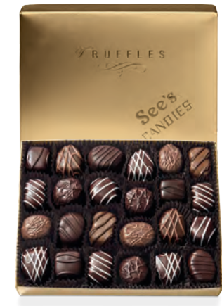
Truffles Wonderfully decadent and rich. 1 lb $31.00 #500902