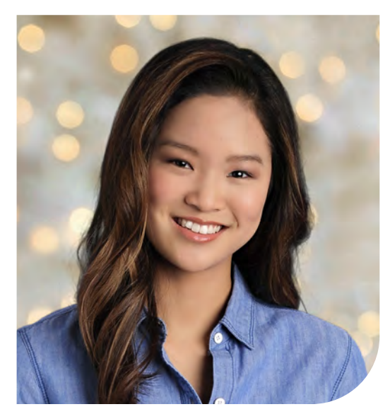
BACKGROUNDS AVAILABLE ONLINE! ¡NUEVOS FONDOS DE OTOÑO DISPONIBLES