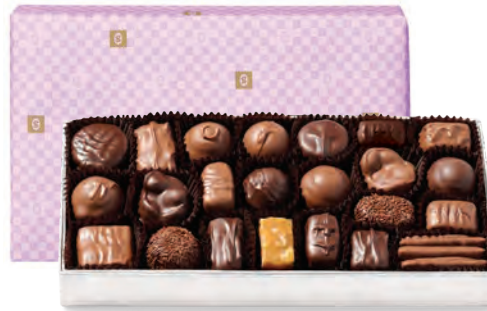
Assorted Chocolates Milk and dark decadence. Delivered in seasonal wrap. 1 lb $31.00 #540318