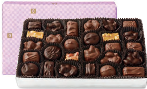
Nuts & Chews Yummy, crunchy and chewy. Delivered in seasonal wrap. 1 lb $31.00 #540334