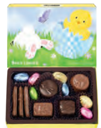
Bunny & Chick Box Beloved See's Classics. 4.8 oz $13.25 #507952