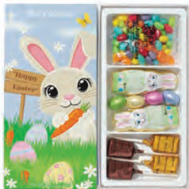
Hoppy Bunny Box An array of adorable bites. 8.6 oz $14.00 #510779