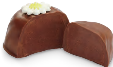
Chocolate Butter Egg Creamy and delicious. 3 oz $8.75 #509500