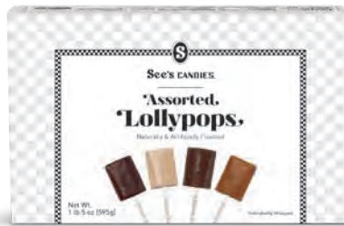
Assorted Lollipops Vanilla, Butterscotch, Café Laté and Chocolate. Naturally & artificially flavored. Approximately 30 lollipops. 1 lb 5 oz $31.00 #506545