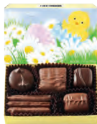
Happy Chick Assortment Full of See's favorites. 3.5 oz $11.50 #507951