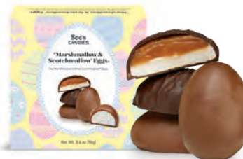
Marshmallow & Scotchmallow® Eggs One box, four yummy eggs. 3.4 oz $9.50 #503321