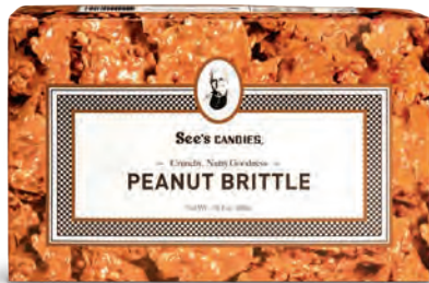
Peanut Brittle Buttery, crunchy and irresistible. 1 lb 8 oz $31.00 #500355