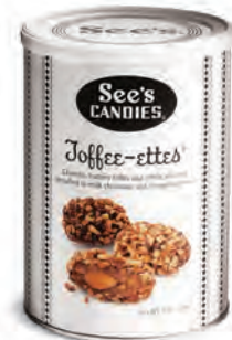
Toffee-ettes® Crunchy toffee, milk chocolate and almonds. 1 lb $31.00 #500316