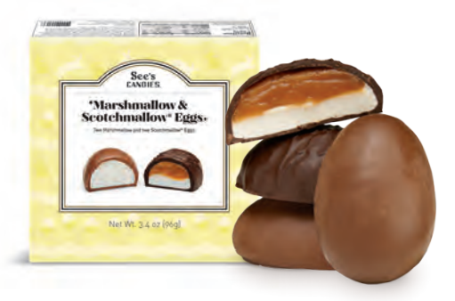
Marshmallow & Scotchmallow Eggs One box, four yummy eggs. 3.4 oz $7.00 #9493