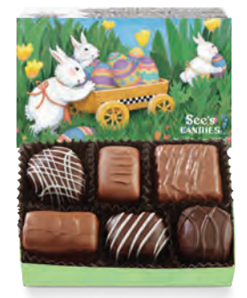
Egg Hunt Box Full of See's favorites. 4 oz $8.00 #9725