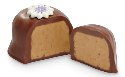
Peanut Butter Egg An irresistible treat. 3 oz $7.00 #9499

Crunchy toffee, milk chocolate and almonds. 1 lb $24.50 #316