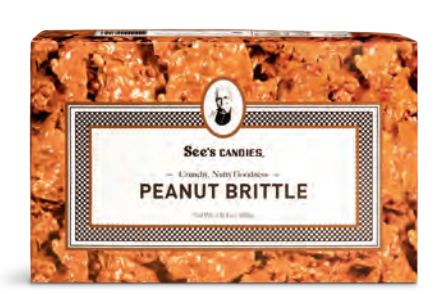
Peanut Brittle Buttery, crunchy and irresistible. 1 lb 8 oz $25.00 #355

Milk and dark decadence. Delivered in seasonal wrap. 1 lb $24.50 #40318