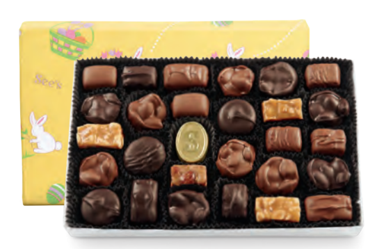
Nuts & Chews

Yummy, crunchy and chewy. Delivered in seasonal wrap. 1 lb $24.50 #40334