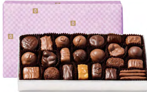
Assorted Chocolates Milk and dark decadence. Delivered in seasonal wrap. 1 lb $33.00 #540318