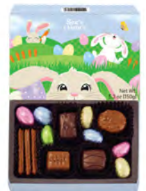
Hoppy Days Box Beloved See's Classics. 5.3 oz $13.75 #511218