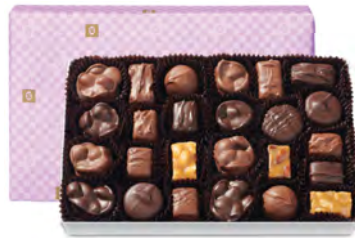
Nuts & Chews Yummy, crunchy and chewy. Delivered in seasonal wrap. 1 lb $33.00 #540334