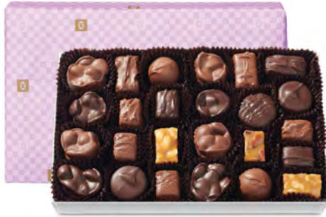
Nuts & Chews Yummy, crunchy and chewy. Delivered in seasonal wrap. 1 lb $33.00 #540334