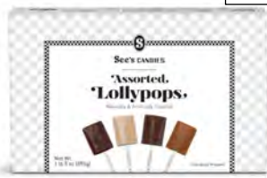
Assorted Lollypops Vanilla, Butterscotch, Café Laté and Chocolate. Naturally & artificially flavored. Approximately 30 lollypops. 1 lb 5 oz $34.50 #506545