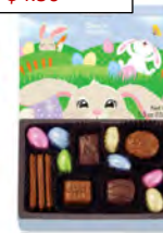
Hoppy Days Box Beloved See's Classics. 5.3 oz $13.75 #511218