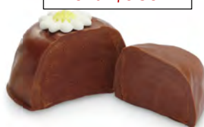
Chocolate Butter Egg Creamy and delicious. 3 oz $9.00 #509500