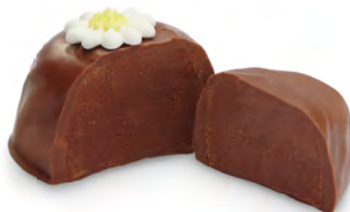
Chocolate Butter Egg Creamy and delicious. 3 oz $9.00 #509500