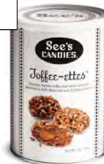
Toffee-ettes® Crunchy toffee, milk chocolate and almonds. 1 lb $33.00 #500316