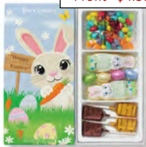
Hoppy Bunny Box An array of adorable bites. 8.6 oz $15.00 #510779