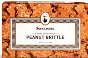
Peanut Brittle Buttery, crunchy and irresistible. 1 lb 8 oz $33.00 #500355