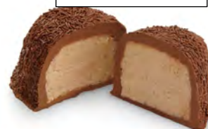
Bordeaux™ Egg A tasty classic. 3 oz $9.00 #509501