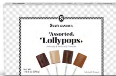
Assorted Lollypops Vanilla, Butterscotch, Café Latté and Chocolate. Naturally & artificially flavored. Approximately 30 lollypops. 1 lb 5 oz $34.50 #506545