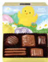
Cheery Chick Box Full of See's favorites. 3.8 oz $11.50 #511211