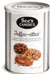
Toffee-ettes® Crunchy toffee, milk chocolate and almonds. 1 lb $33.00 #500316