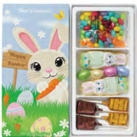
Hoppy Bunny Box An array of adorable bites. 8.6 oz $15.00 #510779