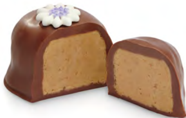
Peanut Butter Egg An irresistible treat. 3 oz $9.00 #509499