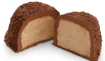
Bordeaux™ Egg A tasty classic. 3 oz $9.00 #509501