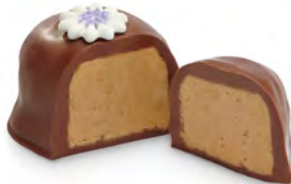
Peanut Butter Egg An irresistible treat. 3 oz $9.00 #509499