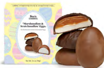
Marshmallow & Scotchmallow® Eggs One box, four yummy eggs. 3.4 oz $11.00 #503321