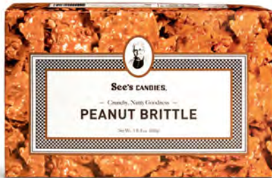
Peanut Brittle Buttery, crunchy and irresistible. 1 lb 8 oz $33.00 #500355