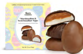
Marshmallow & Scotchmallow® Eggs One box, four yummy eggs. 3.4 oz $11.00 #503321