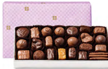
Assorted Chocolates Milk and dark decadence. Delivered in seasonal wrap. 1 lb $33.00 #540318