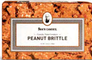
Peanut Brittle Buttery, crunchy and irresistible. 1 lb 8 oz $33.00 #500355