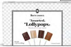
Assorted Lollypops Vanilla, Butterscotch, Café Laté and Chocolate. Naturally & artificially flavored. Approximately 30 lollypops. 1 lb 5 oz $34.50 #506545