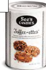
Toffee-ettes® Crunchy toffee, milk chocolate and almonds. 1 lb $33.00 #500316