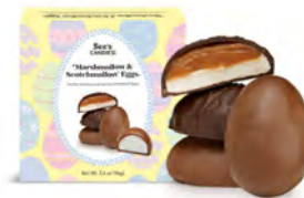
Marshmallow & Scotchmallow® Eggs One box, four yummy eggs. 3.4 oz $11.00 #503321