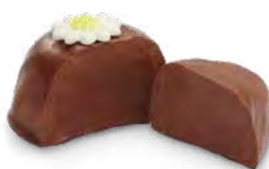
Chocolate Butter Egg