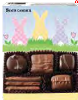
Hoppy Surprise Box

Full of See's favorites. 3.5 oz $11.00 #508693