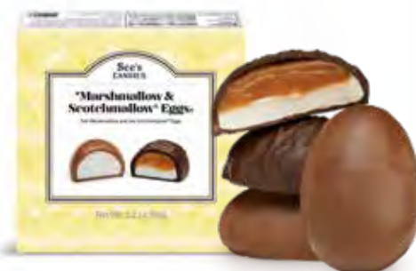
Marshmallow & Scotchmallow® Eggs