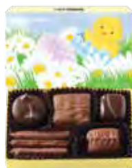
Happy Chick Assortment Full of See's favorites. 3.5 oz $11.00 #507951 Raises: $5.50