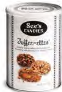
Toffee-ettes® Crunchy toffee, milk chocolate and almonds. 1 lb $29.50 #500316 Raises: $5.90