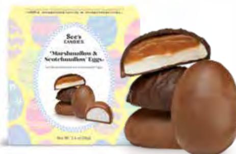
Marshmallow & Scotchmallow Eggs One box, four yummy eggs. 3.4 oz $9.25 #503321 Raises: $4.63