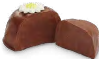
Chocolate Butter Egg Creamy and delicious. 3 oz $8.50 #509500 Raises: $4.25