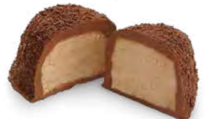
Bordeaux Egg A tasty classic. 3 oz $8.50 #509501 Raises: $4.25