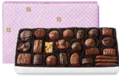
Assorted Chocolates Milk and dark decadence. Delivered in seasonal wrap. 1 lb $29.50 #540318 Raises: $5.90