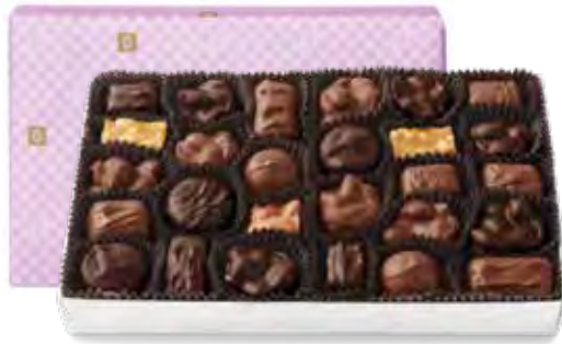
Nuts & Chews Yummy, crunchy and chewy. Delivered in seasonal wrap. 1 lb $29.50 #540334 Raises: $5.90