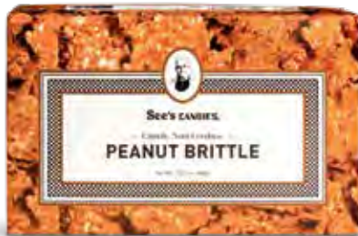
Peanut Brittle Buttery, crunchy and irresistible. 1 lb 8 oz $30.00 #500355 Raises: $6.00