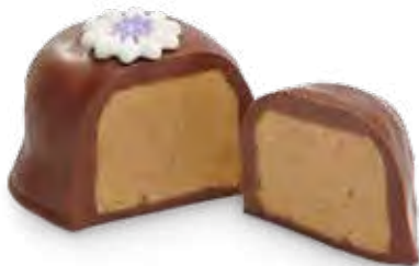
Peanut Butter Egg An irresistible treat. 3 oz $8.50 #509499 Raises: $4.25