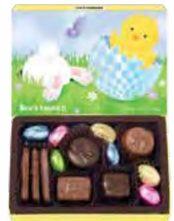
Bunny & Chick Box Beloved See's Classics. 4.8 oz $12.50 #507952 Raises: $2.50