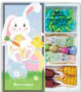
Easter Friends Box An array of adorable bites. 7.5 oz $12.50 #508694 Raises: $2.50