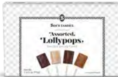
Assorted Lollypops Vanilla, Butterscotch, Café Latte and Chocolate. Naturally & artificially flavored. Approximately 30 lollypops. 1 lb 5 oz $30.00 #506543 Raises: $6.00