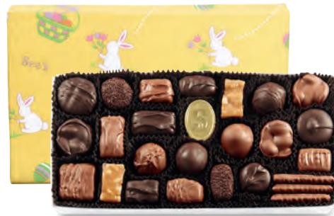
Assorted Chocolates Milk and dark decadence. Delivered in seasonal wrap. 1 lb $24.50 #40318