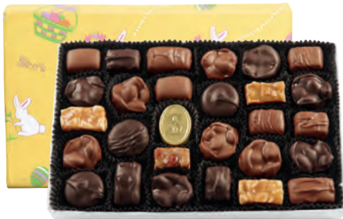
Nuts & Chews Yummy, crunchy and chewy. Delivered in seasonal wrap. 1 lb $24.50 #40334