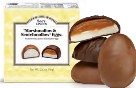
Marshmallow & Scotchmallow® Eggs One box, four yummy eggs. 3.4 oz $7.00 #9493