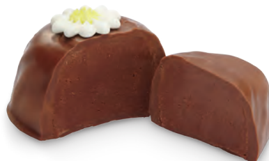
Chocolate Butter Egg Creamy and delicious. 3 oz $7.00 #9500