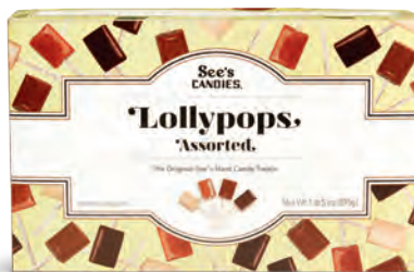
Assorted Lollypops Vanilla, Butterscotch, Café Latté and Chocolate. Approximately 30 lollypops. 1 lb 5 oz $22.50 #296