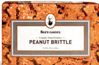
Peanut Brittle Buttery, crunchy and irresistible. 1 lb 8 oz $25.00 #355