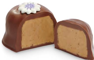
Peanut Butter Egg An irresistible treat. 3 oz $7.00 #9499