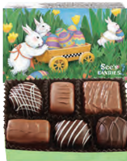
Egg Hunt Box Full of See's favorites. 4 oz $8.00 #9725