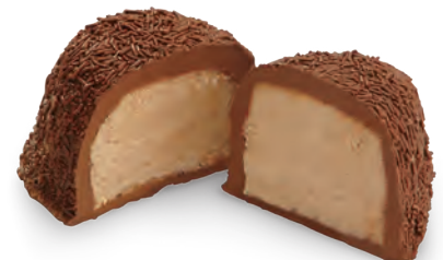
Bordeaux™ Egg A tasty classic. 3 oz $7.00 #9501