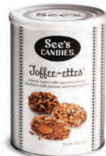
Toffee-ettes® Crunchy toffee, milk chocolate and almonds. 1 lb $24.50 #316